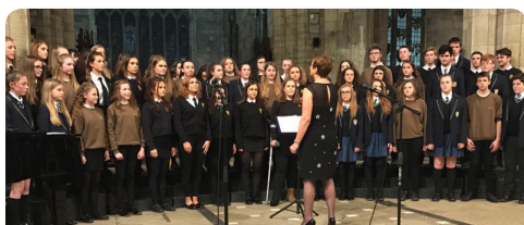
YGC Carol Concert 2016

Many thanks to all the staff and pupils for their hard work and making the night a success.