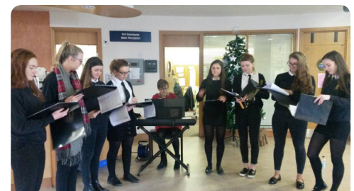
Yr.12 a 13 choir at Ysbyty Glan Clwyd's cancer ward