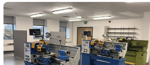
The Technology Department