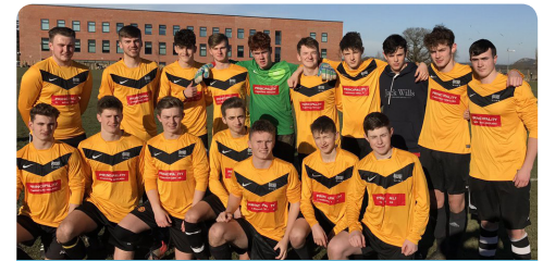
The 6th form Football Team

Well done to the 6th Form Football team who beat Llanfyllin 5-1.