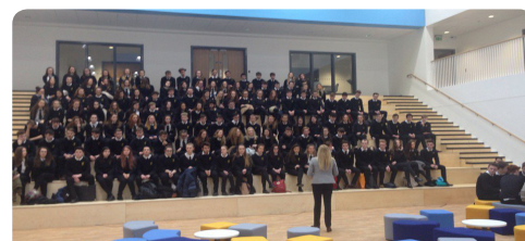
The 6th Form having their first meeting in the new school