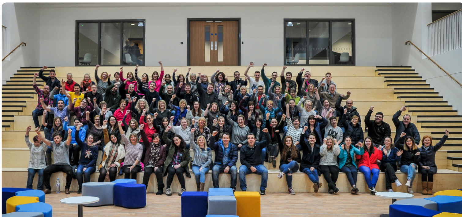
Teachers and staff celebrate the opening of the new building