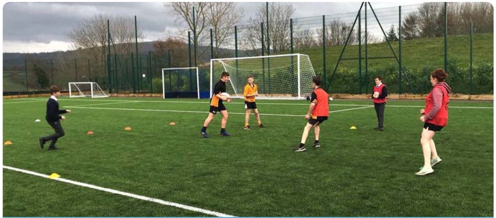
Year 10 boys and girls completing their leadership rugby course

Congratulations to the 14 boys and girls from year 10 who have completed their leadership rugby course through their Bacc lessons.