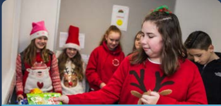
Year 8 students doing their part

Thank you to all the pupils from year 7 and 8 who had been busy collecting for the Vale of Clwyd Food Bank, there was an array of food on its way to the food bank this Christmas.