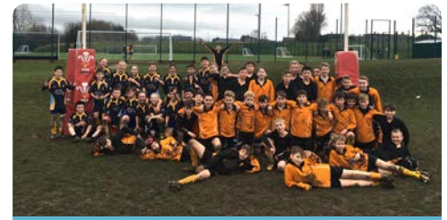
The year 7 rugby team

Congratulations to the year 8 rugby team who won the Denbighshire round of the RGC cup and who are through to the next North East round.