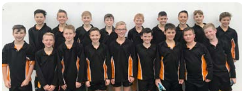
The year 7 football team

Congratulations to the year 7 boys' football team, who won the last four consecutive matches and have reached the last 16 matches in Wales. The team will play home against Ysgol Friars next. Good Luck on reaching the quarter finals.