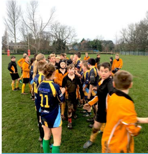
Year 7 after their victory over Ysgol Dyffryn Conwy

A busy term for year 7 boys, who won their rugby game against Ysgol Dyffryn Conwy. It was encouraging to see so many enthusiastic year 7 boys (over half playing their first rugby game) interested, we were able to create two teams.