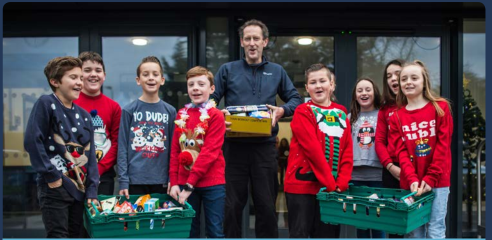
Year 7 students displaying (a small part) of their contribution.