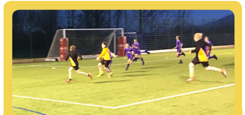
Year 8 finish off in style on the new all weather pitch as the Denbighshire Round winners for the RGC Cup.

Congratulations to the year 8 rugby team who won the Denbighshire round of the RGC cup and who are through to the next North East round.