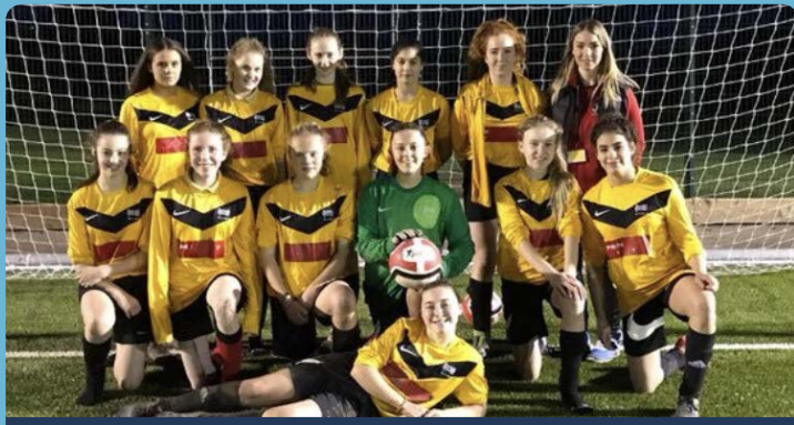
Year 9 and 10 Girls who reached the FA Welsh Cup Final