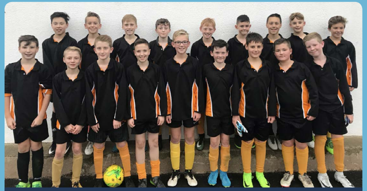
Year 7 Boys who reached the FA Welsh Cup Final

A huge congratulations to the year 7 and 8 girls' football team for reaching the quarter finals and to the senior girls' football team as well as the year 7 football team for successfully reaching the last 16 in the 'WSFA' Welsh Cup final after winning at county level.