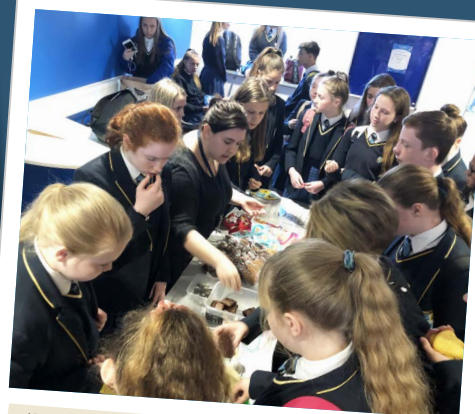
THE CAKE STALL WAS VERY BUSY, THERE MUST BE LOTS OF SWEET-TOOTHS IN THE SCHOOL