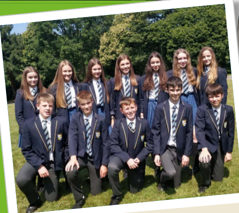
'Y TALWRN' TEAM, ABERYSTWYTH 20TH JULY 2019