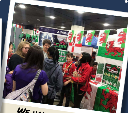
WE HAD SO MUCH FUN SHOWCASING OUR WORK AT OUR STAND

World Festival, which is held annually, is a massive celebration of everything to do with robotics, and there's always a fierce but friendly competition between the nations. This year, the event attracted over 70,000 visitors from all four corners of the World. It included over 1,300 robots competing against each other in a number of different challenges set by the organisers and marked by a panel of renowned judges.