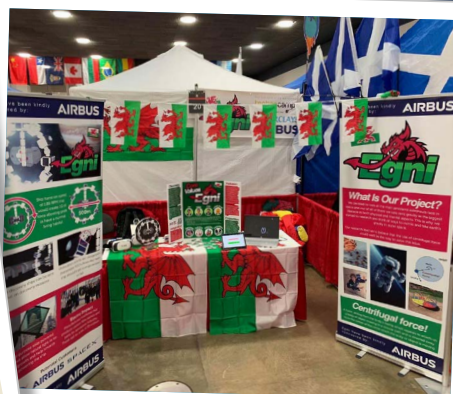
EVERYTHING SET! WHAT COUNTRY ARE WE REPRESENTING AGAIN?