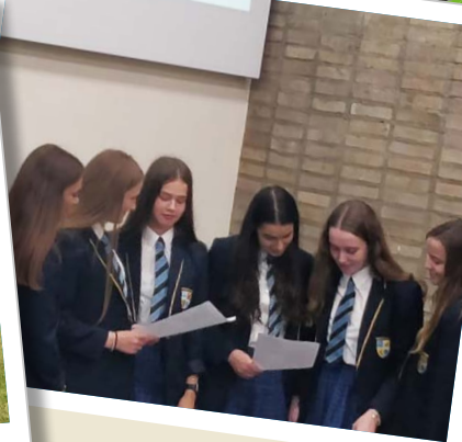
SOME OF THE TEAM RECITING ON STAGE